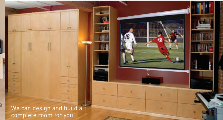
We can design and build a complete room for you!

We're celebrating over 40 years in business as the specialists in space saving ideas you can sleep on! Come into our showroom and let us show you how "INSTANT BEDROOMS WILL CHANGE YOUR LIFE"