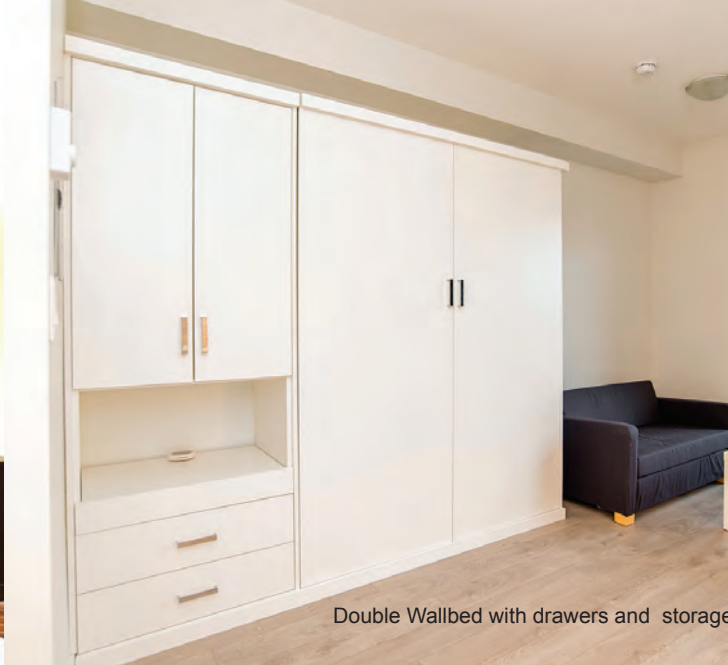
Double Wallbed with drawers and storage

We're celebrating over 40 years in business as the specialists in space saving ideas you can sleep on! Come into our showroom and let us show you how "INSTANT BEDROOMS WILL CHANGE YOUR LIFE"