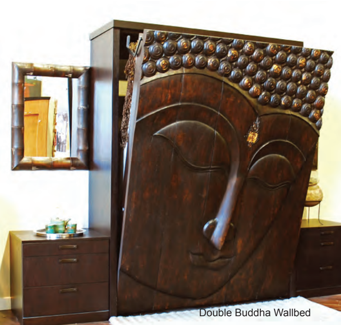
Double Buddha Wallbed