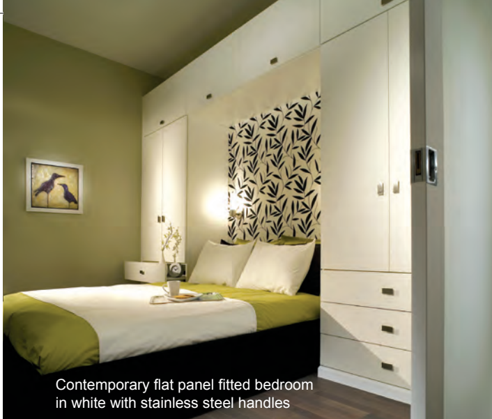
Contemporary flat panel fitted bedroom in white with stainless steel handles