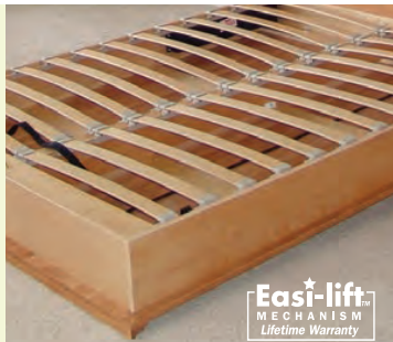
Easi-lift™ MECHANISM Lifetime Warranty

Our famous Easi-Lift™ wall bed mechanism, exclusive to Instant Bedrooms, has been rigorously tested for 30 years.